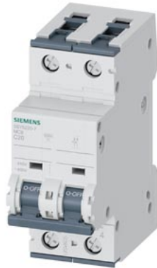
Circuit breaker Universal current 440 V DC 400 V AC 10kA, 2-pole, C, 20A