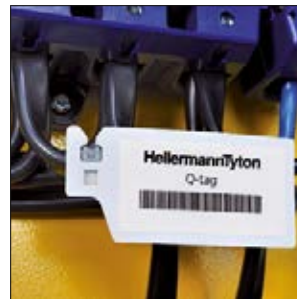
Q-tags can be labelled with pre-printed labels or by hand.