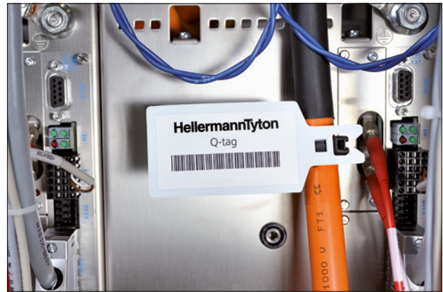
The flagged orientation of Q-tags ensures that printed texts are easily visible.

Please find the corresponding labels on page 463.