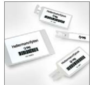
Q-tags are available in different sizes and types.