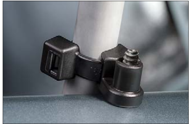
SBH2 allow cables to run at 90° to the panel.