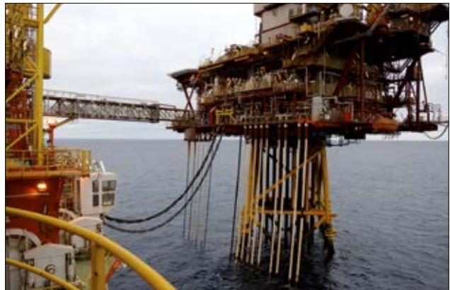
The HelaGuard LTSUL galvanised steel conduit with a PVC Cover is UL listed and typically used on drilling platforms.